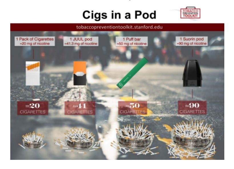
Fig. 1) Sample campaign poster taken from the Stanford Tobacco Prevention Toolkit

School-wide messaging campaigns may include school-wide distribution of age-appropriate posters and flyers that emphasize fact-based information. Messaging tactics will avoid shaming or fear-based approaches. School personnel and community partners may host school-based events, such as tables or assemblies, to share prevention-focused information with students.